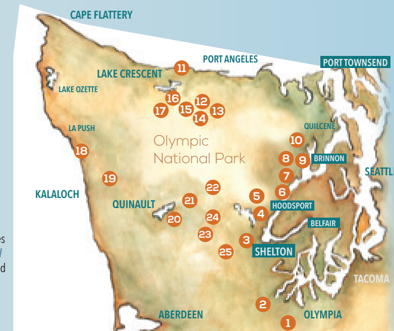
NOTE: MAP NOT TO SCALE, FOR ILLUSTRATION PURPOSES ONLY.

25. PORTER FALLS (1.6 MILE ROUND-TRIP - EASY) Porter Creek Rd, 2.9 miles B-0150 Rd, .5 mile, B-Line 0.9 mile Capitol State Forest, Discover Pass required, kid/dog friendly Located at the confluence of the South and West Forks of Porter Creek. Here one branch cuts through a cleft while the other plunges over a ledge into a big punchbowl.